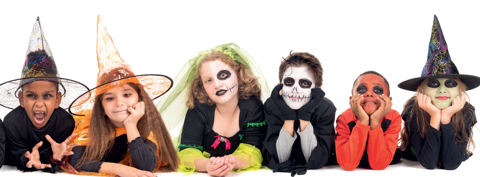
Kids dressed up in spooky costumes for Halloween.