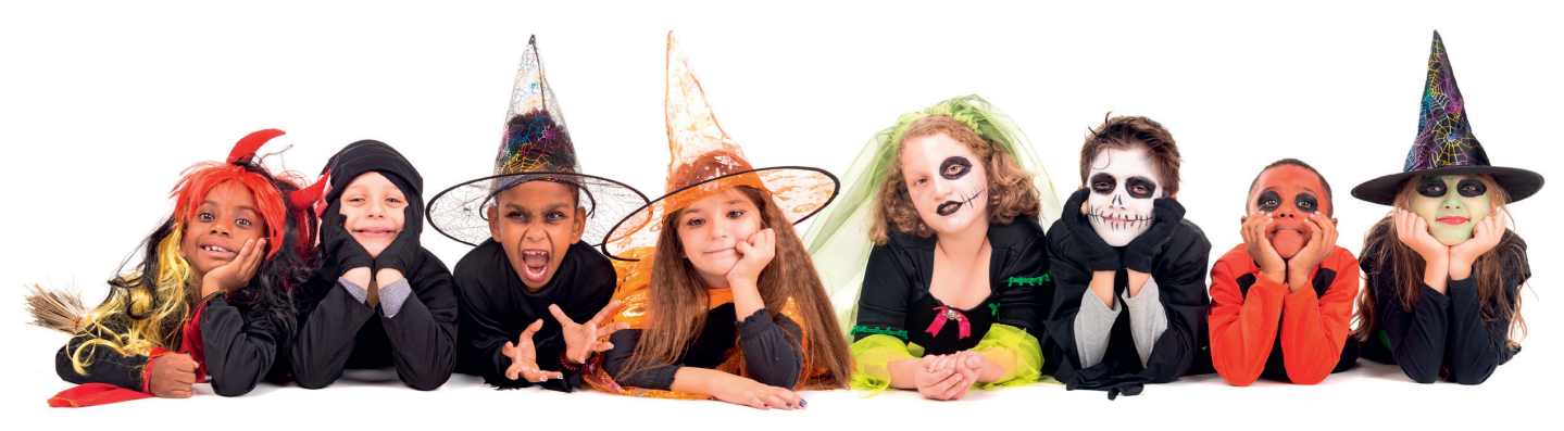
We're dressed up in spooky costumes for Halloween.